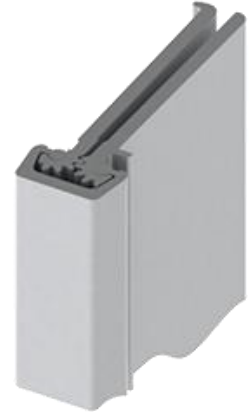
AGH-224HD Gear Hinge