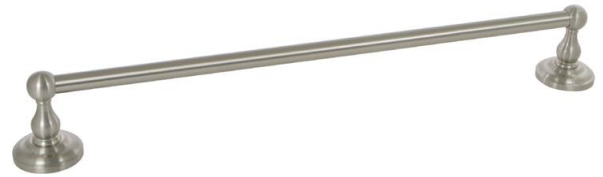
Towel Bar Set US15