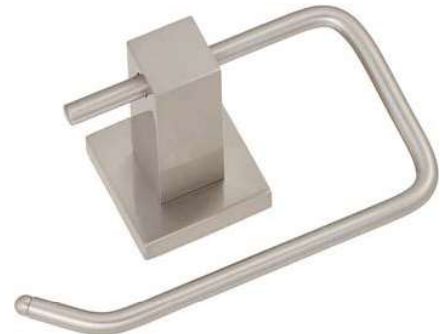
Euro Paper Holder US15