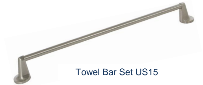
Towel Bar Set US15