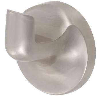
Double Robe Hook US15