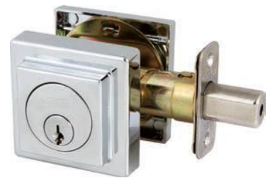
200LTS-US26 Single Cylinder