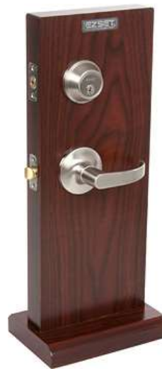
SAN DIEGO (SD)