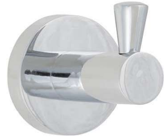
Robe Hook US26