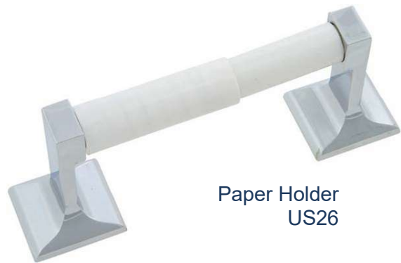
Paper Holder US26