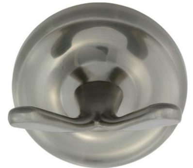
Double Robe Hook US15